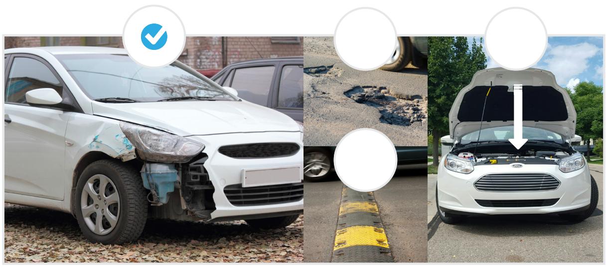
Figure 1- The \ Crash Code\ application\ discriminates\ between\ actual\ crash\ events\ and\ non-crash\ noise,\ such\ as\ pot\ holes,\ speed\ bumps,\ and\ hood\ or\ door\ slams.