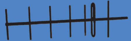
10 dB gain antenna

Dataradio makes system installation easier with our UHF antenna kits. Each kit includes a premium quality Yagi antenna, mounting bracket, surge protector, grounding kit, 25' LMR-400 feedline, cable ties, weather kit, and jumper cable. Additional antenna feedline is available in 25' and 55' lengths.