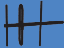
6 dB gain antenna